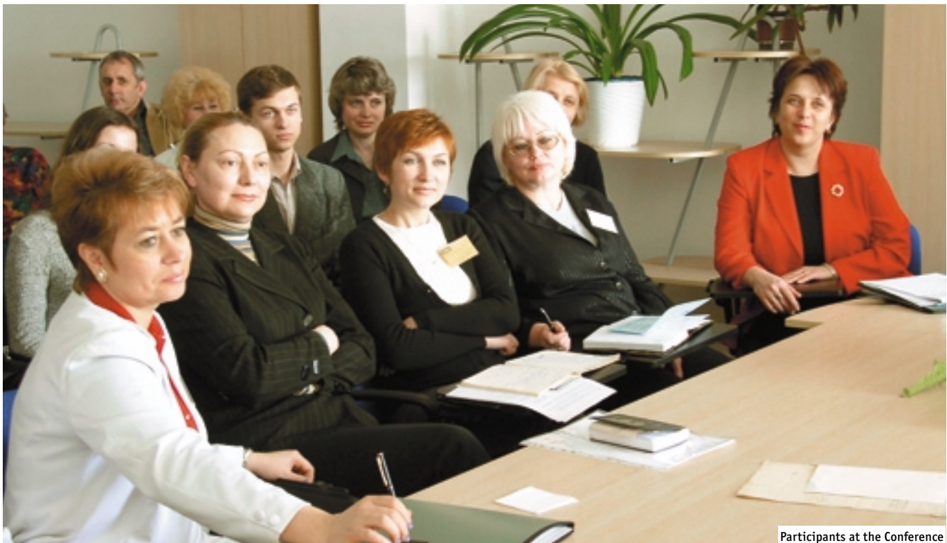
Participants at the Conference