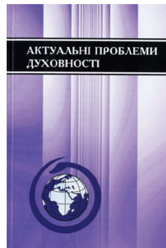
Current Issues in Spirituality edited by Yaroslav Shramko