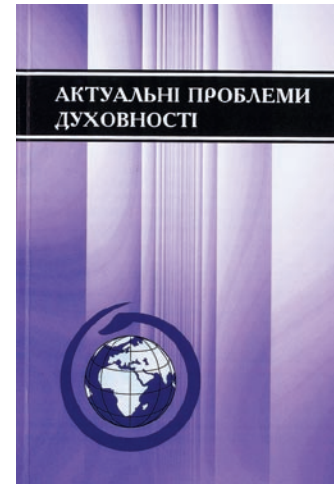
Current Issues in Spirituality edited by Yaroslav Shramko