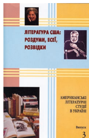
Literature of the USA: Essays, Reflections, Researches