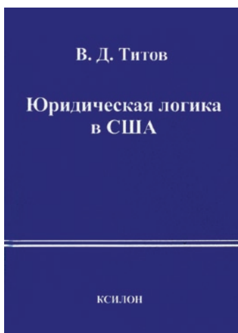
Juridical Logic in U.S. by Volodymyr Tytov